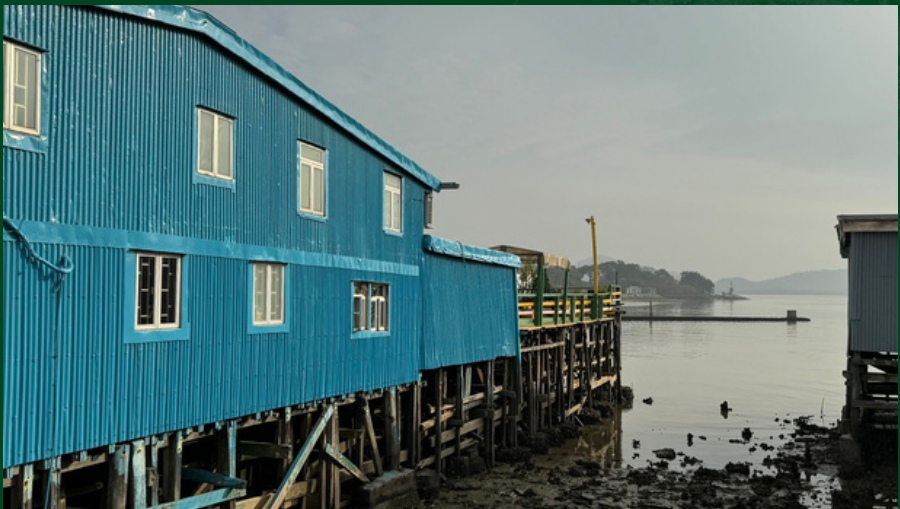
A part of the Coloane

Coloane Village is located in the southernmost part of Macao and is known as the “Backyard Garden of Macao”. The scenery is pleasant, quiet and comfortable. When you come to visit, you could stroll through Portuguese-style alleys and glimpse the rapid development of Henqin or satisfy your appetite for the famous Portuguese tarts as well as smell the sea breeze and stroll around the fish stores. Anyway, I hope you could get to know Coloane better, so please follow the footsteps of “Lihua” to explore the past and present of Coloane Village!