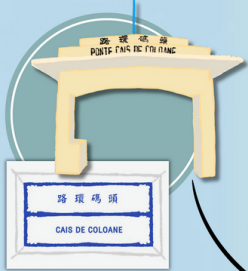
路環碼頭 CAIS DE COLÔNEAS