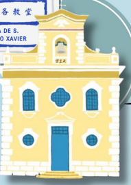
聖方濟各教堂 CAPELA DE S. FRANCISCO XAVIER